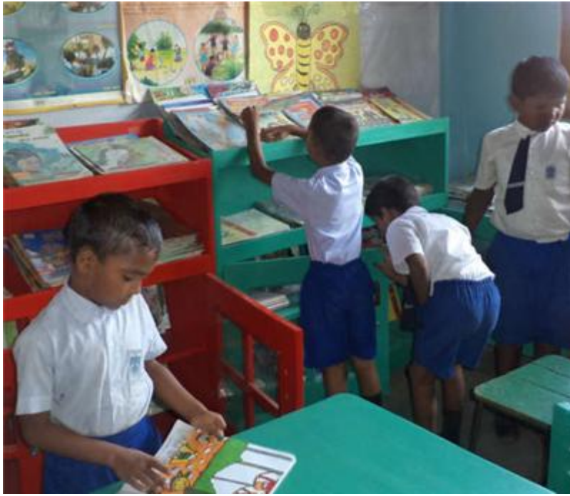
Children selecting books to read during a visit to the school library.