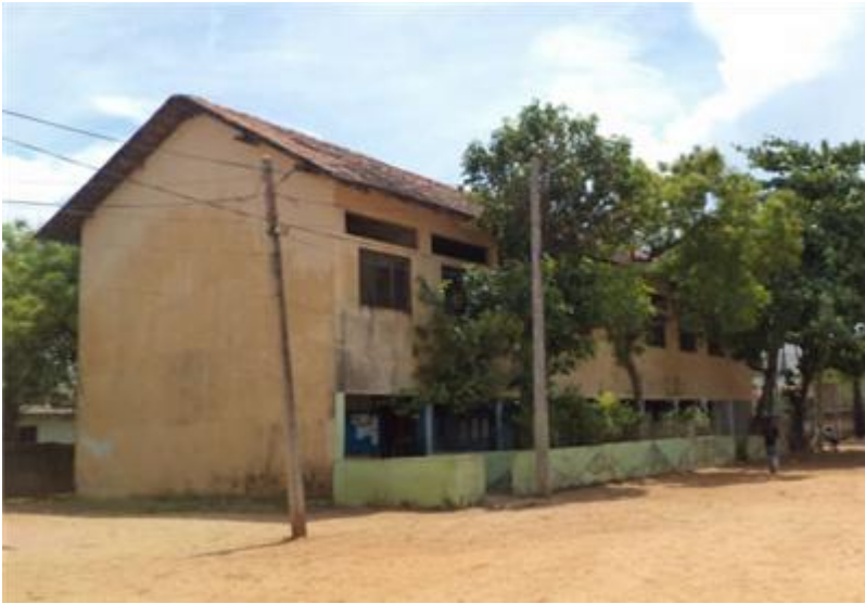
Exterior view of the school building where the new library is located.