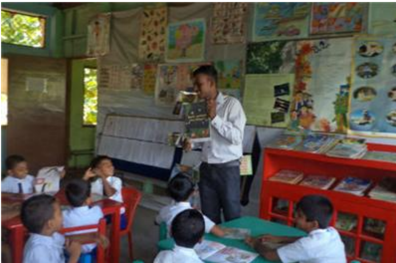
A teacher engaging students in a reading activity.