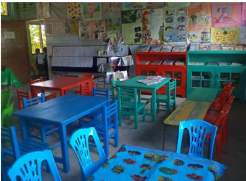
Furniture and other resources provided by Room to Read.